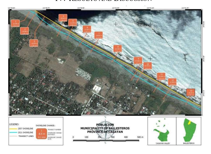
Fig. 2. Shoreline Retreat for the past 14 years.

Fig. 2 used a satellite image from 2007 and it shows the location of the shoreline from that year and its landward movement over the years. The shoreline was represented by a