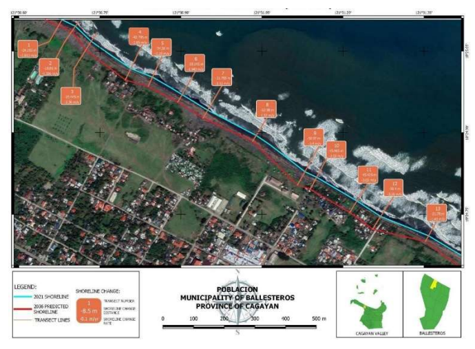
Fig. 3. Predicted Shoreline in 15 years

It was found that the area covered by the displacement is approximately forty-eight thousand five hundred eighty-four (48,584) square meters, more or less. This signifies that approximately 5 hectares have been lost from the land resources of the two barangays namely Centro East and Centro West in the municipality of Ballesteros. This finding is worth informing the LGU of Ballesteros for proper action.