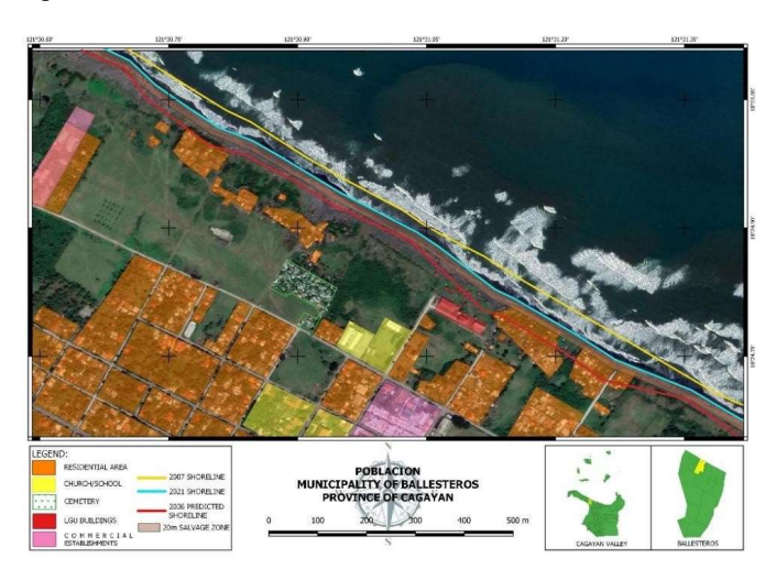
Fig. 4. Predicted Shoreline in 15 years

It was discovered that the displacement of the transect points of the shoreline if there is no human intervention and the rate of change will stay the same of the area that will be lost in Poblacion is fifty-one thousand five hundred seventy (51,570) square meters.