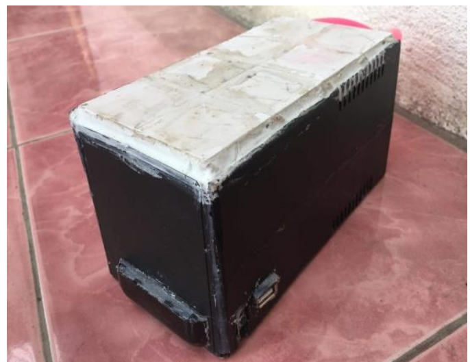
Fig. 3. The perspective view of the device showing the bottom where the TEGs are attached.

The working prototype of the device is shown in Fig. 3, Fig. 4 and Fig 5. The thermoelectric generator modules are directly mounted to the radiator to balance the temperature difference. On the other side of the radiator, the water tank and motor pump which provide circulation of the water and batteries are mounted. The connected power bank circuitry is placed at the back of the device to show the charging capacity of the battery. The equipped USB ports are found above the device. Alongside the power bank circuitry, is the step-down USB port. The casing of the device is a plastic power supply box. The switch is found on the left side of the device which is used to cut on or off the flow of electricity draw to the water pump. The device is lightweight and can be carried anywhere and at any given time.