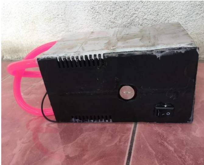
Fig. 4. The perspective view of the device showing the side view where the switch is located.