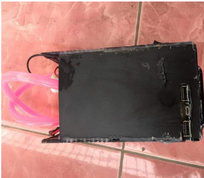
Fig. 5. The perspective view of the device showing the USB ports for charging.

Table I shows the voltage output based on the substance used in the cold side and waste heat source used on hot side. The cold substances used were tap water, cold water and coolant while the waste heat sources were flat iron, BBQ grill, aircon and motorcycle exhaust. The duration of the testing was for 15 minutes only. The percent charge of the battery was computed to show the increase of voltage. The initial battery voltage was the voltage before testing while the final battery voltage was the voltage after testing the device. The change in temperature was calculated to determine how well the waste heat source and substance work in the device. The percent charged was also computed to determine how much charge have change in the battery during the 15 minutes of testing.