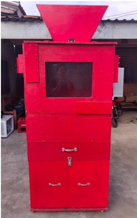
Fig. 3. The vermicast production machine.

Fig. 3 presents the different perspectives of the complete and operating Automated Vermicast Production Machine. The machine is approximately 2.21 meters tall and is built in a vertical manner to achieve effective production of vermicasts and worm migration. The frame of the machine is made of wood and covered with light colored paint to provide good thermal insulation for the worms. The wood is also coated with putty and paint to make it water-resistant. The entire machine is designed for indoor grounds with caster roller wheel for better mobility.